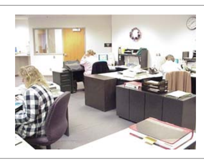
The civil staff processes all the paperwork, as well as assisting citizens at the front counter.

In comparison to 1999, the Civil division has seen the most increase in demand and services for the year 2000. In 1999, the division processed a grand total of 18,573 court processes. This